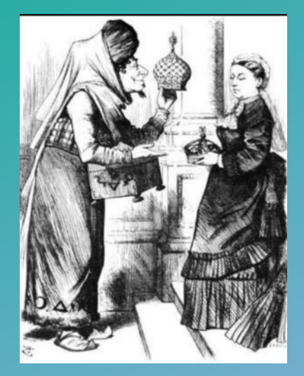
(Disraeli Exchanging The Empress of India Crown for The Crown of England)